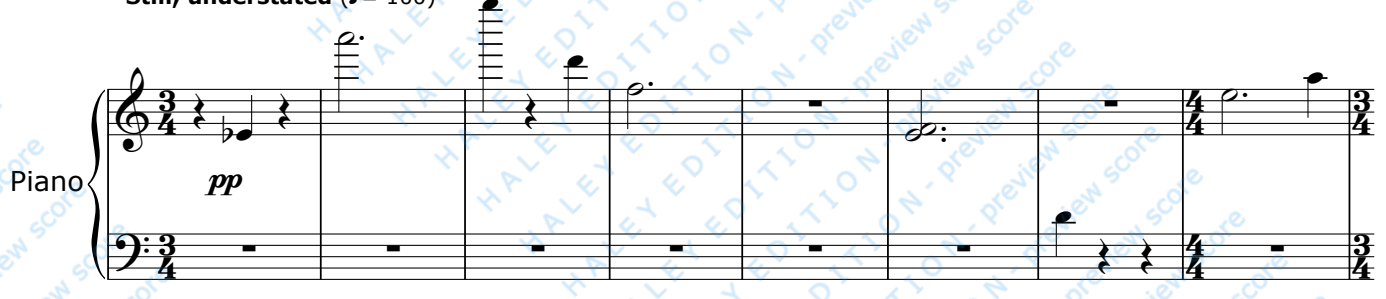
\mathfrak{Ped} Depress sustain pedal and hold throughout