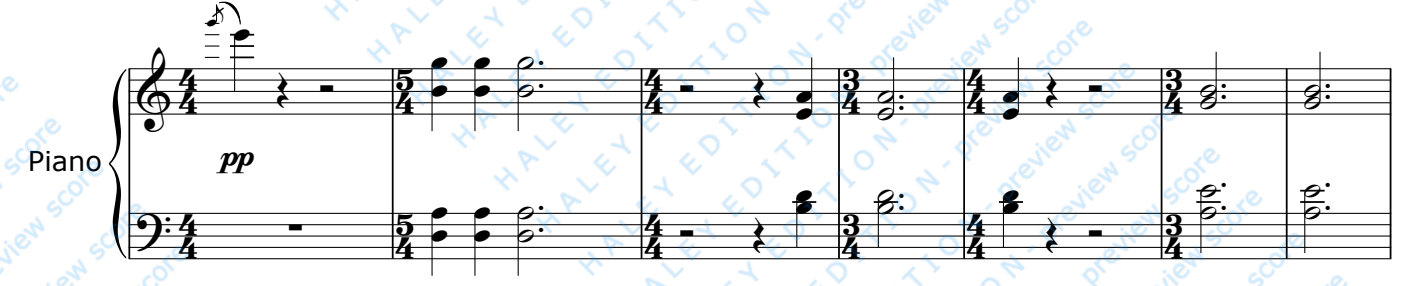
\mathfrak{Ped} . Depress sustain pedal and hold throughout