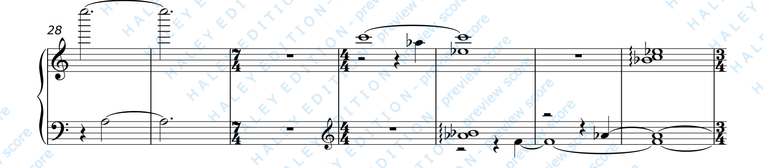
Jupiter Moons 1 4 pieces for solo piano